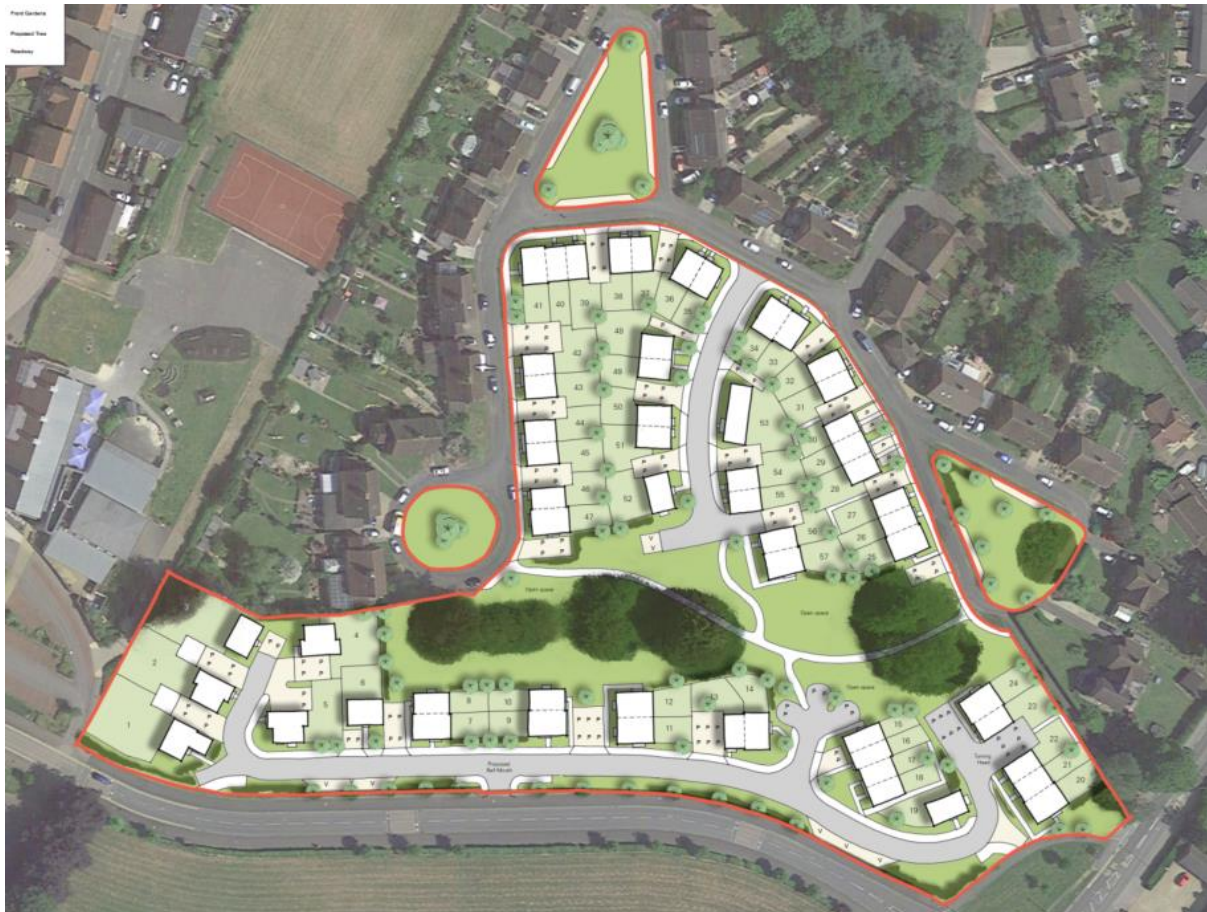
Illustrative Layout Plan